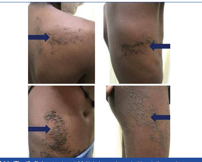
[Table/Fig-1]: Before treatment-Multiple hyperpigmented keratotic papules, distributed linearly over the right shoulder, right-side of the trunk along T3, T4 and T5 dermatome, right iliac region (lesions marked with blue arrows).

On cutaneous examination, multiple hyperpigmented keratotic papules were distributed linearly over the right thigh, abdomen, chest, upper back, and right shoulder [Table/Fig-1]. The scalp, nails, and mucous membranes were normal.