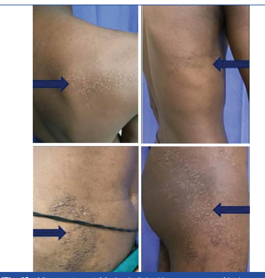
[Table/Fig-3]: After treatment-Marked clinical improvement of lesions over the right shoulder, right-side of the trunk along T3, T4 and T5 dermatome, right iliac region (lesions marked with blue arrows) seen after four months of treatment with oral acitretin 25 mg.